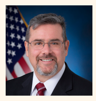
Donald Palmer Commissioner U.S. Election Assistance Commission